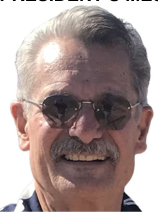
Hello Valley V-8's Club members —

Greetings, Happy New Year to all! Looking forward to another amazing Year for us individually, our families, and as a Car Club, cheers!